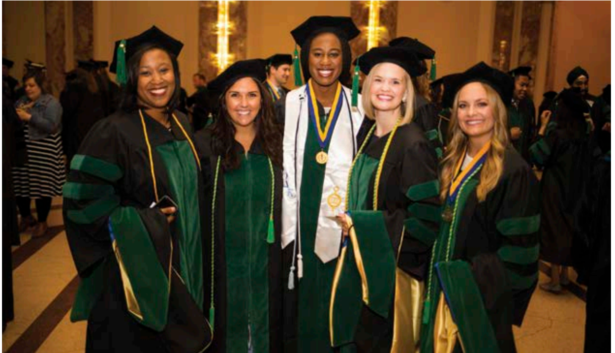
Generous donations help the School of Medicine add 100-plus physicians to the medical workforce each year.