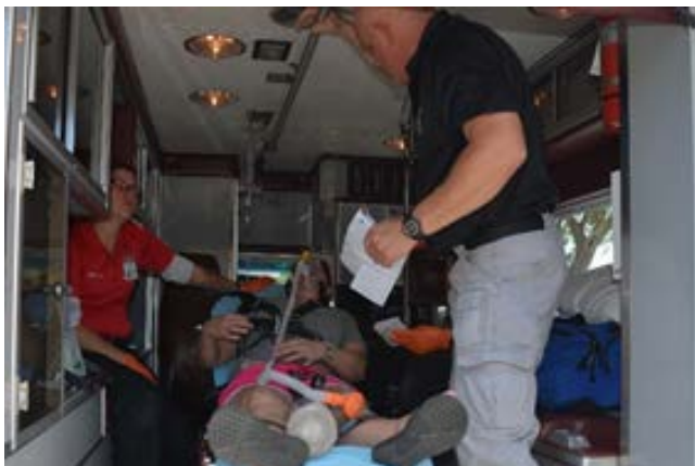
UMKC's Paramedic students participate in the Paramedic Field Operations event held in Hutchinson, Kansas each summer.

The program allows no more than 10% of any one section of the course, or 10% of the total course in absences. Participants must carefully consider the impact of any time away from the course on their attendance requirements and their ability to be successful in the program. Students who miss time from class are required to make up missed work and recover missed information from other members of their squad.