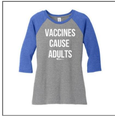
Vaccines Cause Adults Women's Fitted Baseball Tee