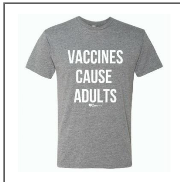
Vaccines Cause Adults Men's/ Unisex Tee