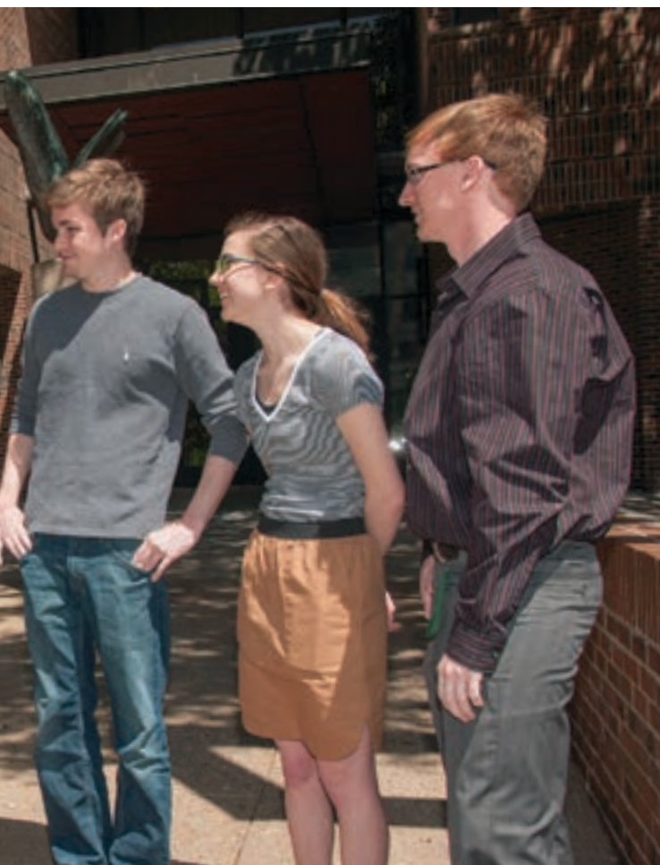
17 or 18 years old and in six years turn them into a physician,” Dean