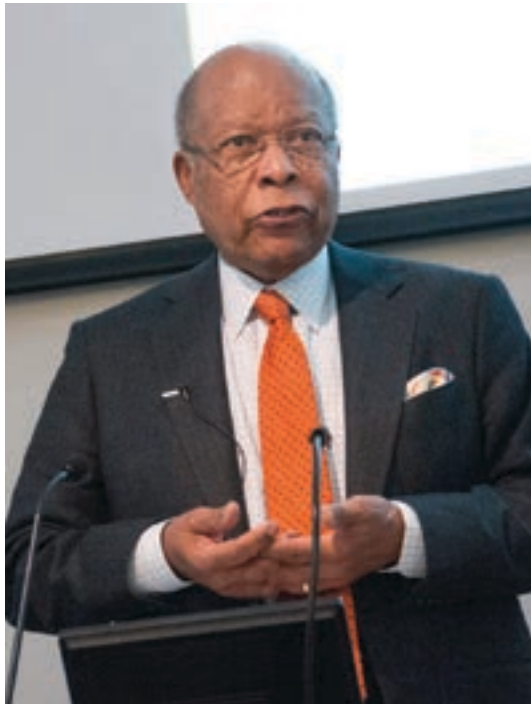
Louis Sullivan, M.D., promotes health literacy.