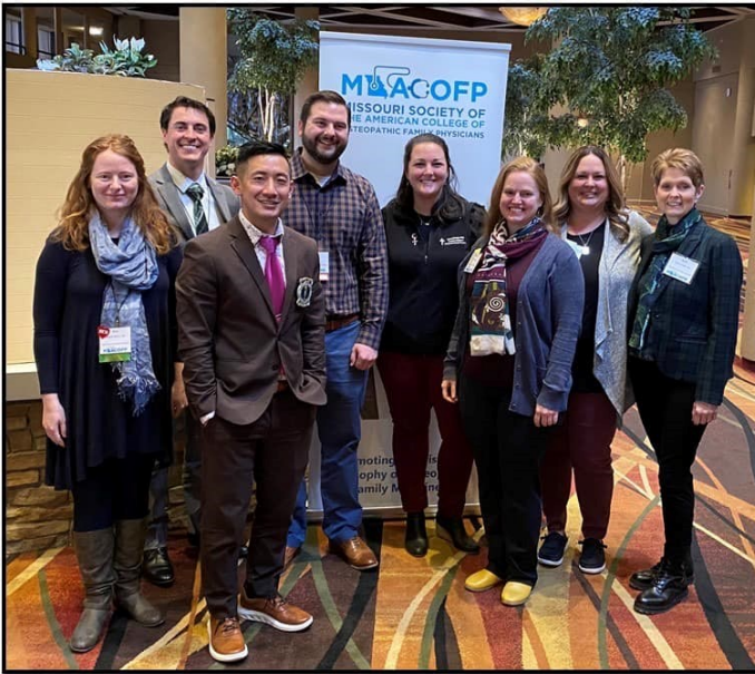
Our faculty and residents at the MSACOF meeting