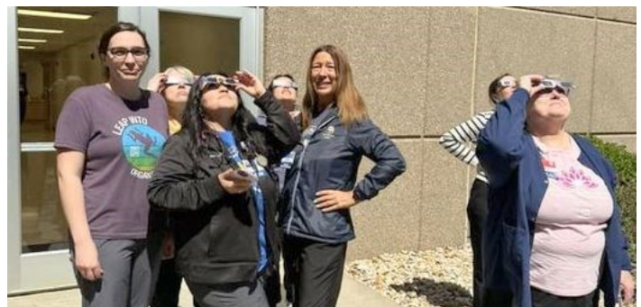
Safe solar eclipse viewing