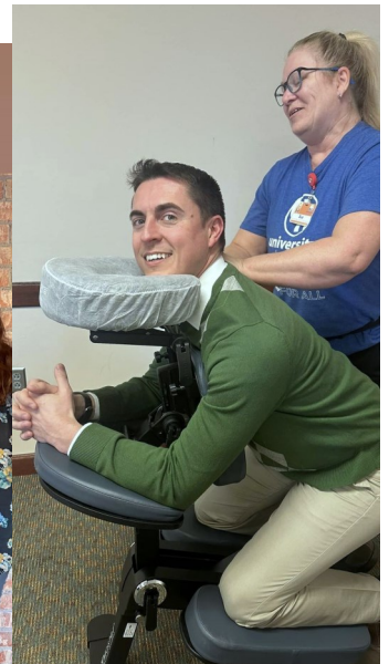
Massage on Resident Appreciation Day